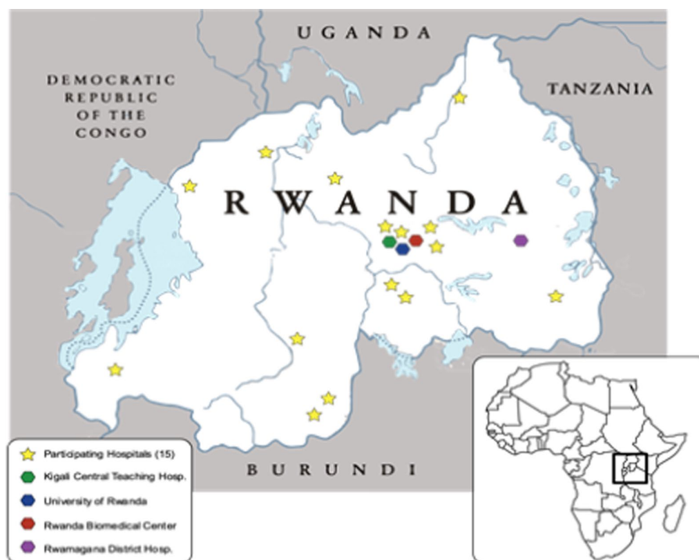
Fig. 1 LAISDAR participating institutions

The LAISDAR (Leveraging Artificial Intelligence and Data Science Techniques in Harmonizing, Sharing, Accessing and Analyzing SARS-COV-2/COVID-19 Data in Rwanda) project is a federated data network, based on the Observational Medical Outcomes Partnership (OMOP) Common Data Model (CDM), as well as on open-source Observational Health Data Sciences and Informatics (OHDSI) tools for data analytics and network integration, and R Studio and Python. As demonstrated in Fig. 1, the network will include several hospitals, whose EHR (Electronic Health Records) data will be harmonized to OMOP CDM, and enriched both with COVID-19 test results, COVID-19 survey results from a national database, and the results of the community surveys. An initial proof-of-concept (POC) implementation